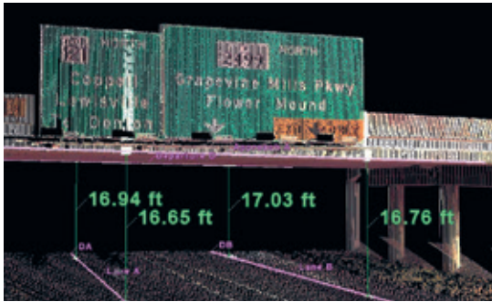
One of the many powerful measurement and annotation tools is an automated tool for analyzing and documenting clearances at overcrossings.