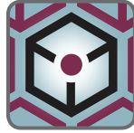
IMAGINiT Utilities for Revit

Enhance your Autodesk software and drive greater efficiency across your entire organization with these time saving tools from IMAGINiT's group of professional programmers.