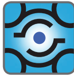
IMAGINiT Clarity Security