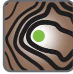
IMAGINiT Utilities for Civil 3D