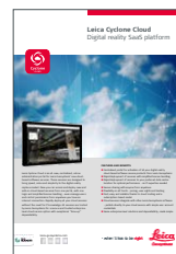
Leica Cyclone Cloud Flyer

Copyright Leica Geosystems AG, 9435 Heerbrugg, Switzerland. All rights reserved. Printed in Switzerland – 2017. Leica Geosystems AG is part of Hexagon AB. 865476enus - 11.17