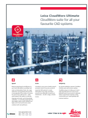
Leica CloudWorx Ultimate Data Sheet

Leica Geosystems AG Heinrich-Wild-Strasse 9435 Heerbrugg, Switzerland +41 71 727 31 31