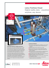
Leica TruView Cloud Flyer