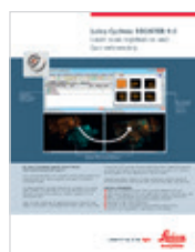
Leica Cyclone REGISTER